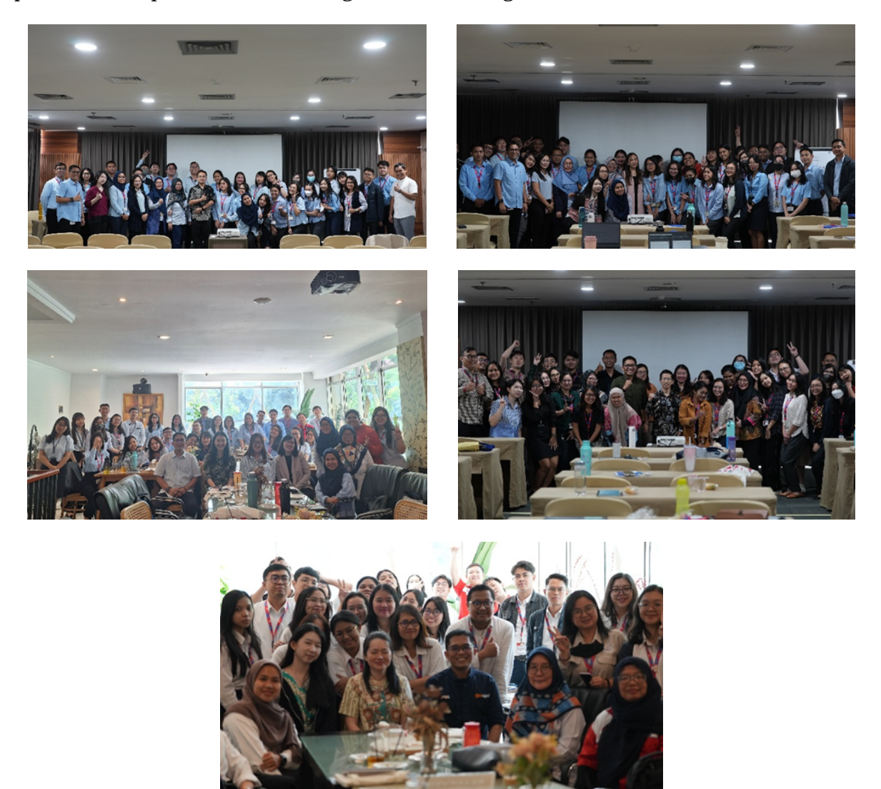
Figure 3. Photos of the Training from Day 1- Day 5

of accounting expertise also plays a part, it turns out that their problem is primarily related to the intricate transactions they handle on a daily basis. The lecturers have decided to allocate more time for question-and-answer sessions in addition to providing updated training materials. These changes make the attendees quite enthusiastic and ask a lot of questions throughout the course. Due to time constraints, TSM lecturers were even forced to halt the questions. The photos of the training are shown in Figure 3.