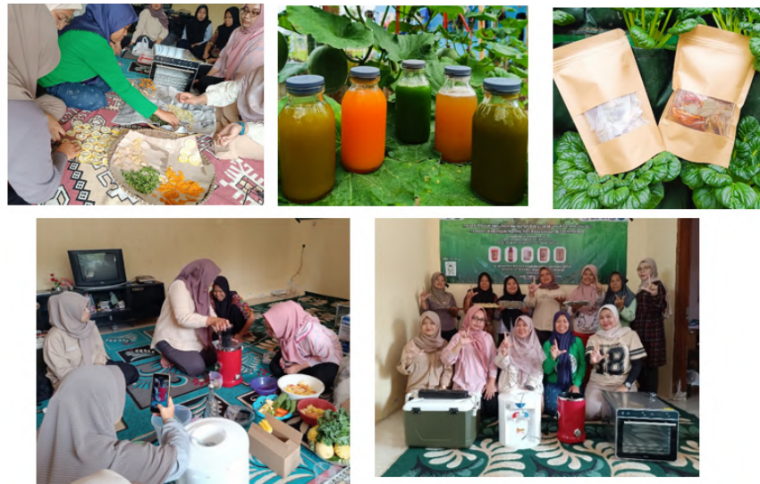
Figure 5. Introduction to the Machine and Workshop for Making Healthy Drinks