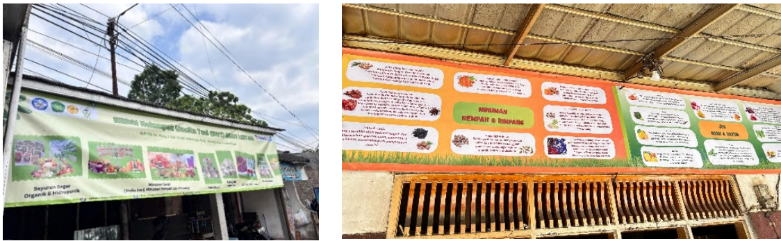
Figure 7. Monitoring dan Evaluation Production House