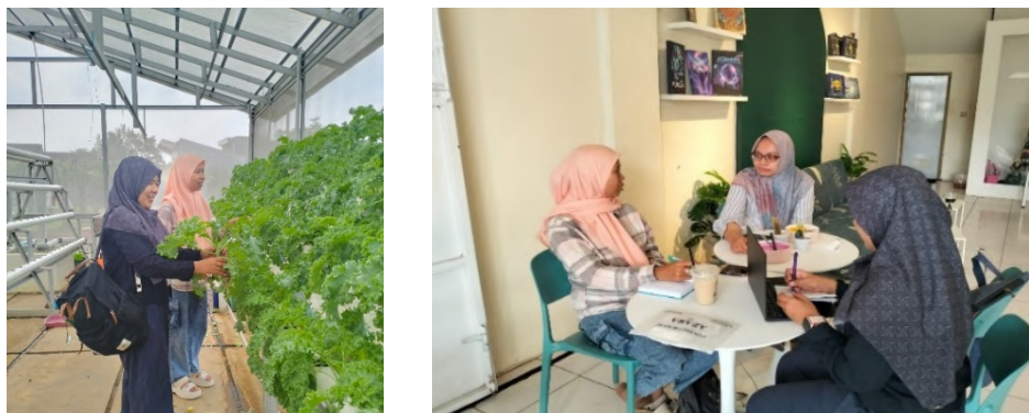
Figure 6. Monitoring dan Evaluation

This activity focused on monitoring and evaluating improvements in the quality of healthy beverage production, the efficiency of raw material use, and strategies for maintaining product consistency. In addition, raw material purchasing and Kale harvesting activities were carried out to support the availability of local ingredients while strengthening food security and the economic independence of farmer groups. This monitoring and evaluation process is crucial for providing constructive input and criticism for the business development of KWT Roay Lestari. These improvements include internal communication, financial and business management, product marketing, and effective production processes for greater hygiene and security.