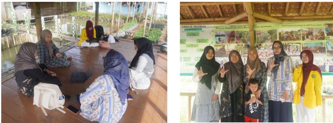
Figure 1. Initial Survey and Socialization of Activity Plan

On June 14, 2025, initial survey and program socialization are conducted. This agenda consists of site survey, program socialization, coordination with management, and data collection and recording of the initial conditions of the facilities to be used to ensure readiness for implementation of the community service activities for the Roay Lestari Tasikmalaya Women Farmers Group.