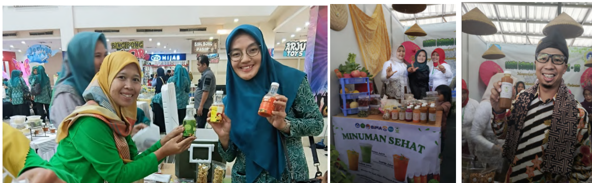
Figure 9. Sales of Healthy Drink Products from KWT Roay Lestari

The majority of the Roay Lestari Women's Farmers Group has felt the positive impact of this community service program. This program is highly relevant to the Roay Lestari Women's Farmers Group's needs in developing their businesses. The Roay Lestari Women's Farmers Group has experienced direct economic empowerment through the innovation of cold-pressed juice and herbal drinks, which are considered innovative and have good market potential. Furthermore, the provision of agricultural product diversification and healthy beverage counseling, as well as workshops on business and financial management, have also been deemed highly beneficial for managing their businesses more professionally.