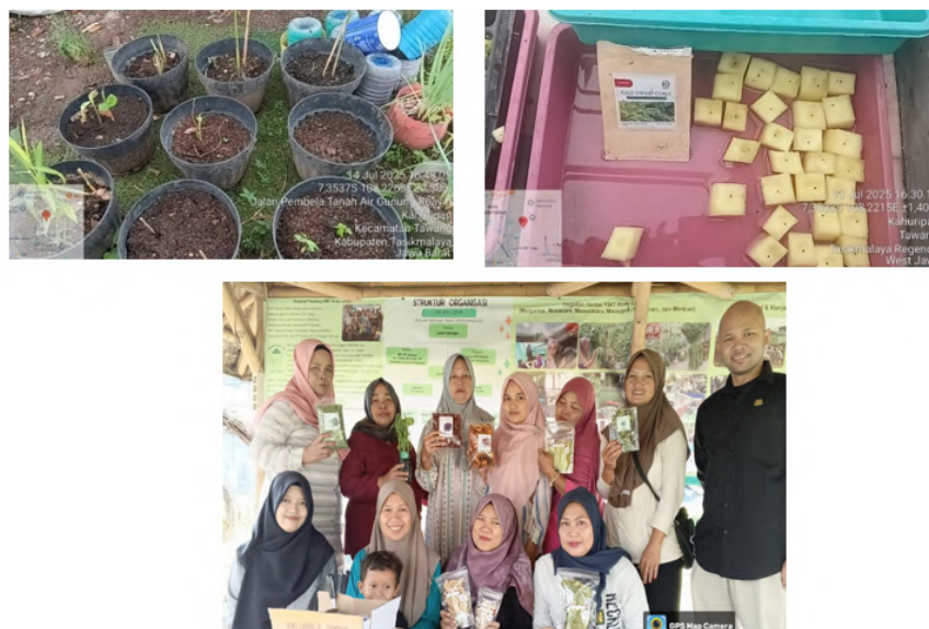
Figure 4. Handover and Planting of Seedlings

This activity supports the sustainable availability of local raw materials, strengthens the food security of farmer groups and teams by assisting in the planting process, providing technical guidance on seedling care, and encouraging the implementation of environmentally friendly agricultural systems.