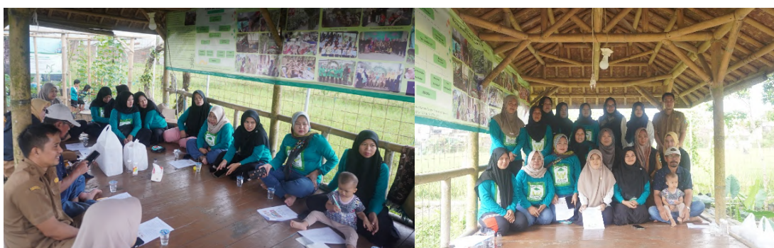
Figure 2. Focus Group Discussion and Product Diversification Counseling

After that, Focus Group Discussion (FGD) and counseling on 30 June 2025. It began with a Focus Group Discussion (FGD) on the potential for developing healthy drinks using local ingredients and raising awareness about the importance of agricultural product diversification in supporting family economic resilience. This is in line with Taufik et al. (2025) assertion that agricultural product diversification programs are necessary to improve food security and economic well-being. Therefore, this community service program also seeks to introduce various types of locally sourced crops that can be cultivated and later processed into products with higher economic value.