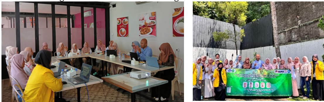
Figure 8. Workshop of Business Management

The workshop, titled "Build Confidence and Manage Business Finance," emphasized the importance of self-confidence as a key asset in starting a business. The second session introduced simple financial methods using Excel to facilitate monitoring of income and expenses. During the training, members of the KWT Roay Lestari demonstrated improved self-confidence and an understanding of the importance of product branding, in addition to the personal branding they have been pursuing. This workshop was held as part of a series of monitoring processes that revealed that KWT Roay Lestari needed training for business management and financial recording.