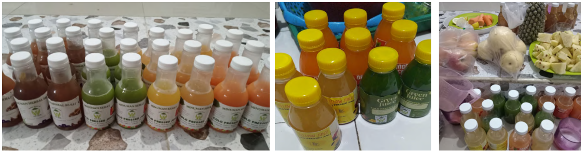
Figure 11. Sustainable Production of Healthy Drinks by KWT Roay Lestari

guarantee freshness and cleanliness to maintain product quality so that the benefits of the product and its sales can be sustainable and provide increased impact and real benefits not only for KWT Roay Lestari members but also the surrounding community and consumers who buy the products.