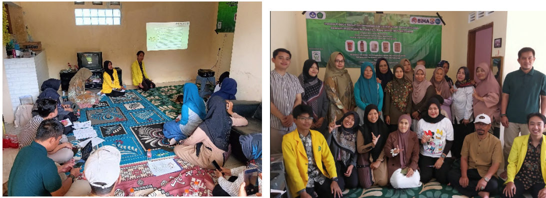
Figure 3. Counseling on the Benefits of Health Drinks

drinks made from local ingredients and the opportunities for developing processed products that can improve community health and well-being. Furthermore, the team provided guidance on processing local raw materials into nutritious beverages, packaging strategies, and marketing potential to strengthen the economy of farmer groups. Marzuki et al. (2023) reported that herbal drinks derived from spices and rhizomes such as turmeric and tamarind have been shown to contain nutrients and active compounds that can boost the body's immune system.